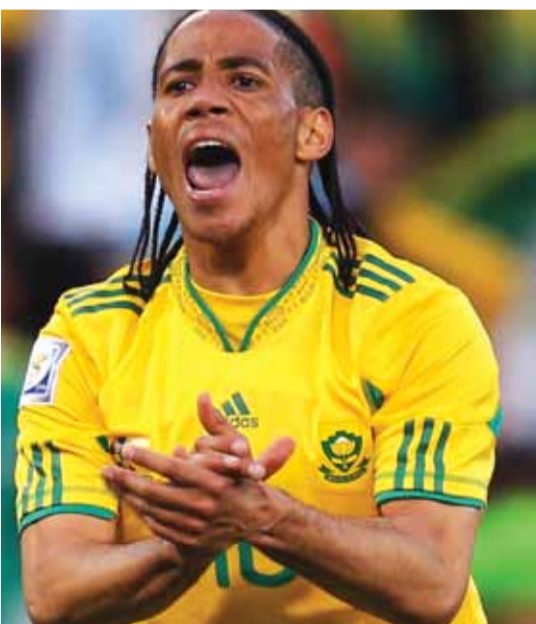
One of the products of the Transnet School of Excellence and former Bafana Captain, Steven Pienaar

The Transnet School of Excellence was founded in 1994, and it identifies talented footballers from underprivileged and rural areas. The prospective stars are afforded quality education and are simultaneously moulded into professional footballers. The school carried out football trials for Under-13 players from Kgatleng at Moruleng Stadium on the 19th of February. These trials had already been areas such as Musina, Sekhukhune, Thulamahashe, Emerlo and Vryburg since August 2016.