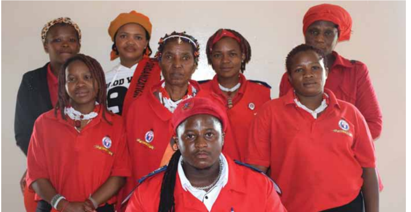
Maloko mangwe a a neng a tsenetse thupelelo

Dingwe tsa ditlhogo tse batsenelapitso ba neng ba rupelelwa ka tsona di akaretse tlhaloso le kalafi ya malwetse a a farologaneng jaaka kankere, kgatelelo ya madi,