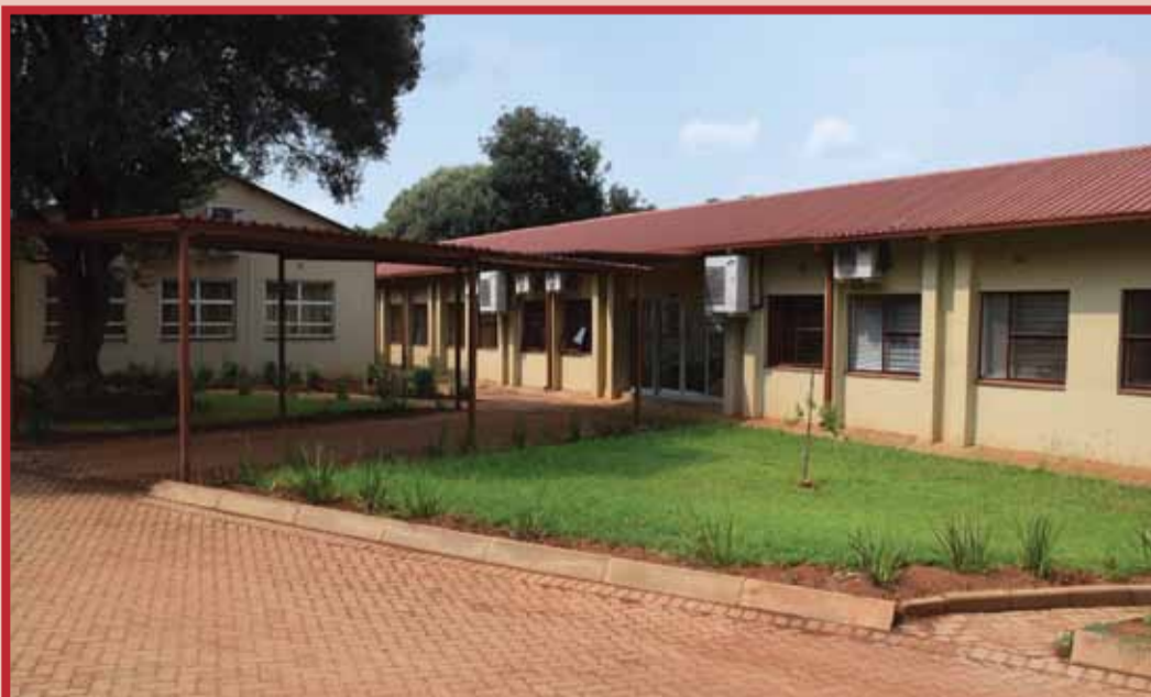
The newly refurbished Old Nurses' Home (Tharabollo) premises

For further queries contact 014 011 1200.