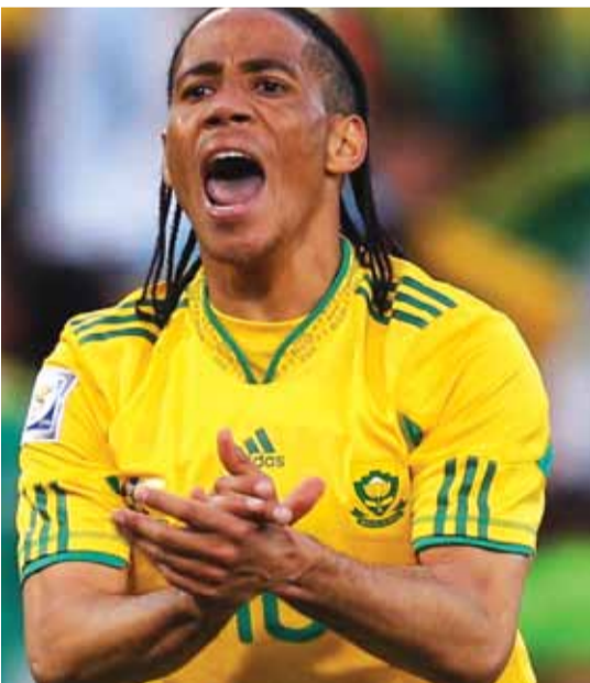
One of the products of the Transnet School of Excellence and former Bafana Captain, Steven Pienaar

The Transnet School of Excellence was founded in 1994, and it identifies talented footballers from underprivileged and rural areas. The prospective stars are afforded quality education and are simultaneously moulded into professional footballers. The school carried out football trials for Under-13 players from Kgatleng at Moruleng Stadium on the 19th of February. These trials had already been areas such as Musina, Sekhukhune, Thulamahashe, Emerlo and Vryburg since August 2016.