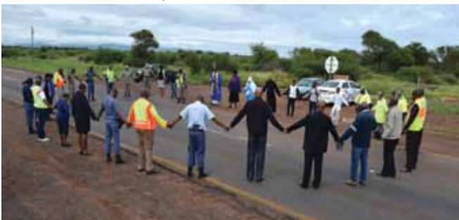
Baruti le batlhankela ba mafapha a a farologaneng ba rapela mo tseleng ya R510

O ikuetse gape go bakgwetsi go nna kelotlhoko mo tseleng le go kgwetsa ka lebelo le le lekanyeditsweng. O konoseditse ka go leboga barulaganyi le botlha ba ba neng ba tsenetse tirelo thapelo.