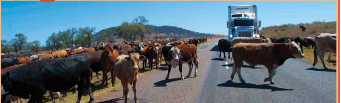
Baagi ba ngongorega ka gore leruo le le sa tlhokomelweng le tlhola dikotsi mo mebileng